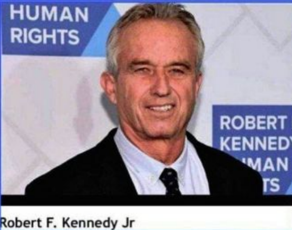
Robert F. Kennedy Jr

"Every part of our lives will be subject to control. This virus is about training us for submission, training us to do what we're told. To not go to the beach unless we're told, to not kiss our girlfriend without their permission. They're turning us into production units and consuming entities. They are going to rob us not only of our democracy and our liberties, but our souls. They are going to inject us with the medicines they want and they're going to charge us for the diseases they give us. They are going to control every part of our lives. What we are doing at Children's Health Defense is using the last instruments of democracy we have left - the Courts - to fight them. We are in the last battle. We are in the apocalypse. We are fighting for the salvation of humanity. We all knew this was coming, though I never believed it would come in my lifetime. But here it is."